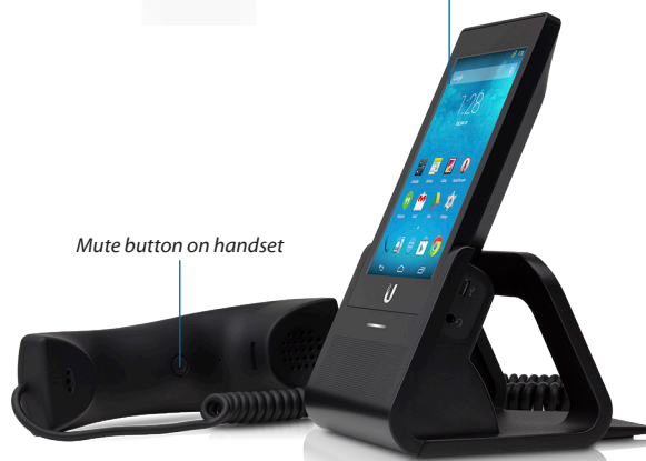
Mute button on handset