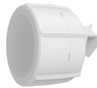
SXT LTE kit