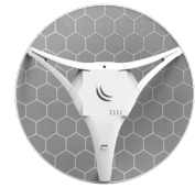
LHG LTE kit

The following MikroTik devices are fully compatible with the InterCell series of base stations.