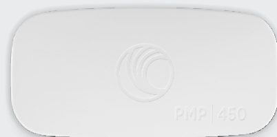
Mid-Gain 17 dBi