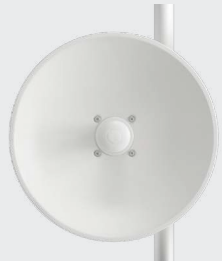
High-Gain 24 dBi