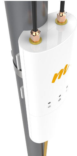
C5c on Pole