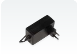
48 V 0.95 A power adapter