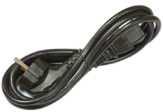
2 IEC cords