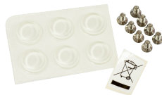
Screw and feet kit