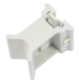
Pole mounting bracket

The unit is equipped with two Ethernet ports (the second port has PoE-out functionality), so you can use it to power up another device. It also has two Micro SIM slots for backup link. Unit is shipped with a 24 V power supply, but can support full range 18-57 V and is 802.3af/at compliant.