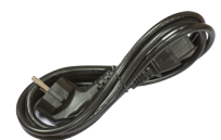
IEC cord (PoE version)