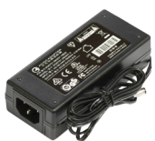
28V 2.57A adapter (PoE version)