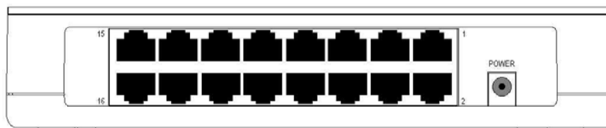
Figure 3-2 TL-SF1016D Switch Rear Panel

The following parts are located on the rear panel: